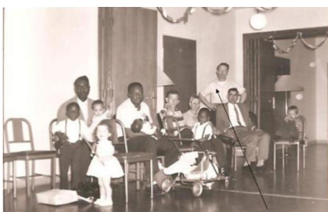
Fellowship at the Sembach AFB Chapel early 1959