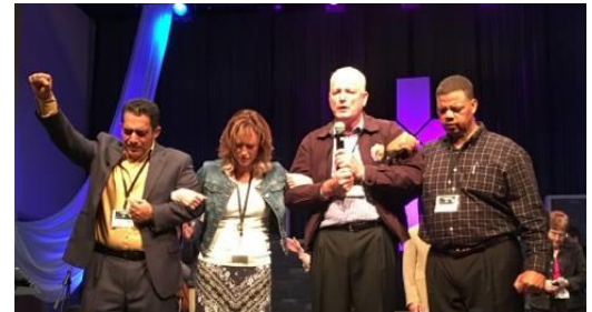
Leaders of the Connecting in Worship Project -- multi-ethnic, male and female, representing 3 states and 2 nations, praying together at the National Warrior Connection Conference, Nov. 2017 – Louisville, KY.